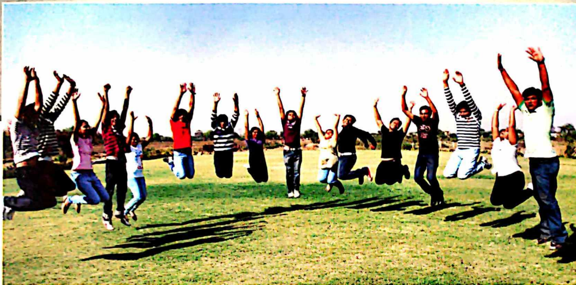
Making Leaders of Tomorrow