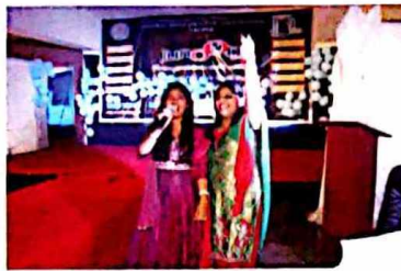
Students Participating in Inter Collegiate Function "Junoon"