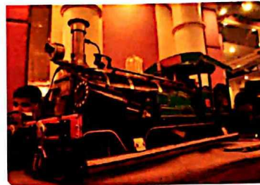
Miniature working models of Automobile brands by Guinness World Record Holder Iqbal Ahmed on display at International Conference IRSGM 2013 organized by CIGI