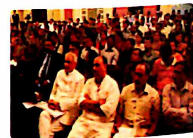
Hon. Ajay Sanchati (Member of Rajyasabha)