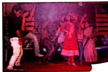
Dance Performance in Inter Collegiate Function Junoon