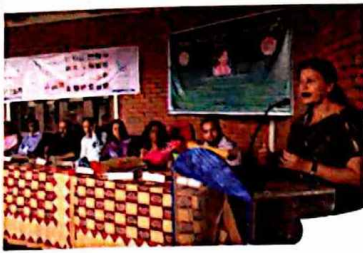
Minister of State for Education Smt. Fauzia Khan Speaking at CIGI