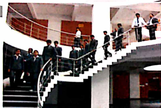
Entrepreneurship & Development Cell at CIGI