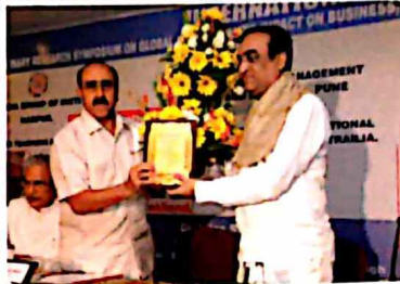
Dr. Anees Ahmed, AICC Secretary felicitating Hon'ble Shri. Ajay Maken, Union Minister for Housing and Urban Poverty Alleviation, Govt. of India at International Conference at IRSGM 2013 organized by CIGI