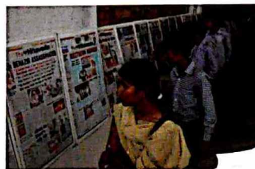
Hitavada Front Page Expo At CIGI