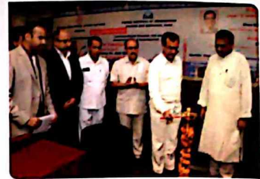
Hon'ble Shri. Ajay Maken, Union Minister Govt. of India, Inaugurating the Industry- Academia Interface session by lighting the "Lamp of Knowledge". at IRSGM 2013