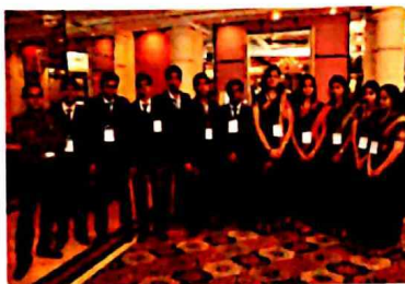
MBA Students Felicitations