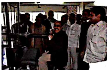
Dignitaries At the Inuagration of Gym in CIGI