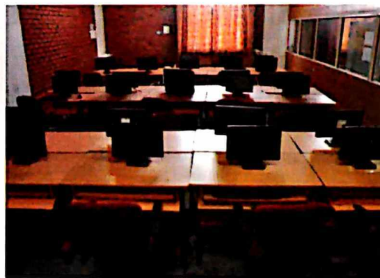
Computer Lab at Central India Group of Institutions